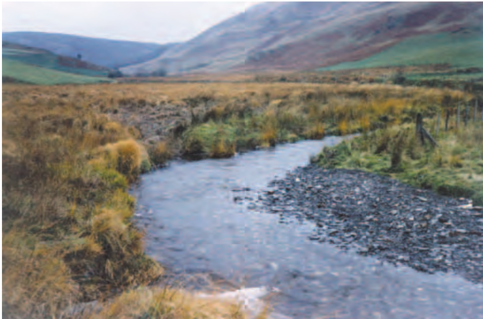
Photograph A for Question 2